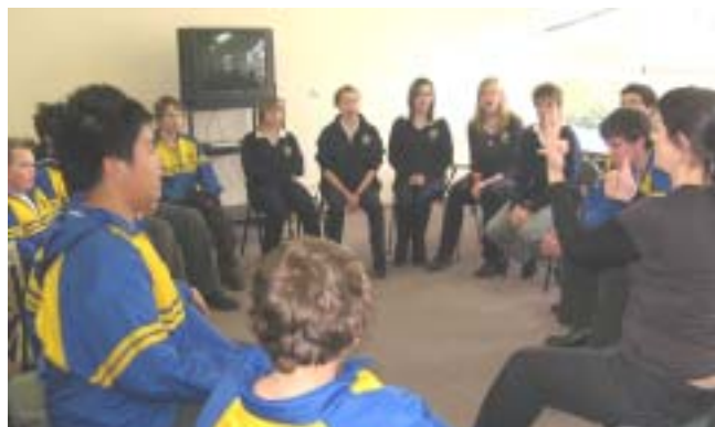
Above: Choir members during their workshop.