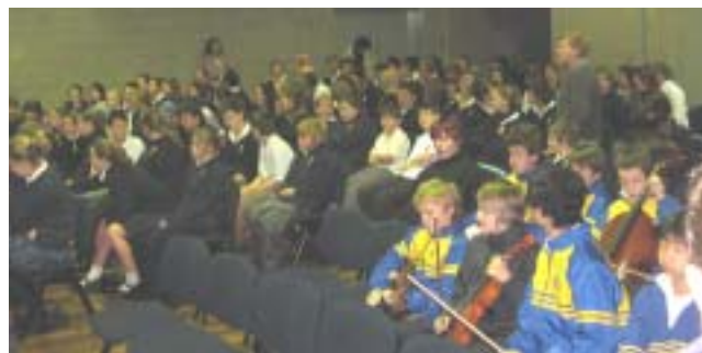
Above: BSC students attend the performance by the De La Salle music students, pictured below.