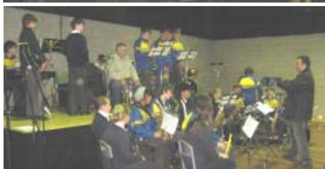
Above: BSC students join the visiting musicians for the instrumental workshop.