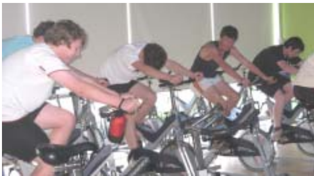
Above: The boys give the exercise bikes a work-out at the YMCA.

The aim of the excursion was to provide a reward for an excellent class effort and results in English during Semester 1 and also to experience a practical activity to draw inspiration for a subsequent writing piece. Students enjoyed the activities and tested their fitness levels, particularly on the bicycles.