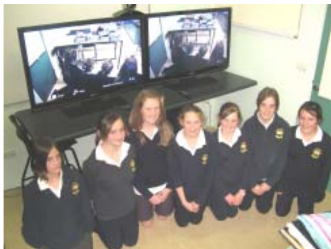
Above: Year 7 students prepare for a link with Donald Secondary College.