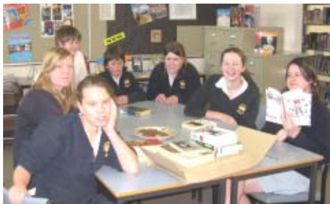
Above & below: Bookclubbers gathered in the Library last Friday. Note the empty Tim Tam plate in the photo below.