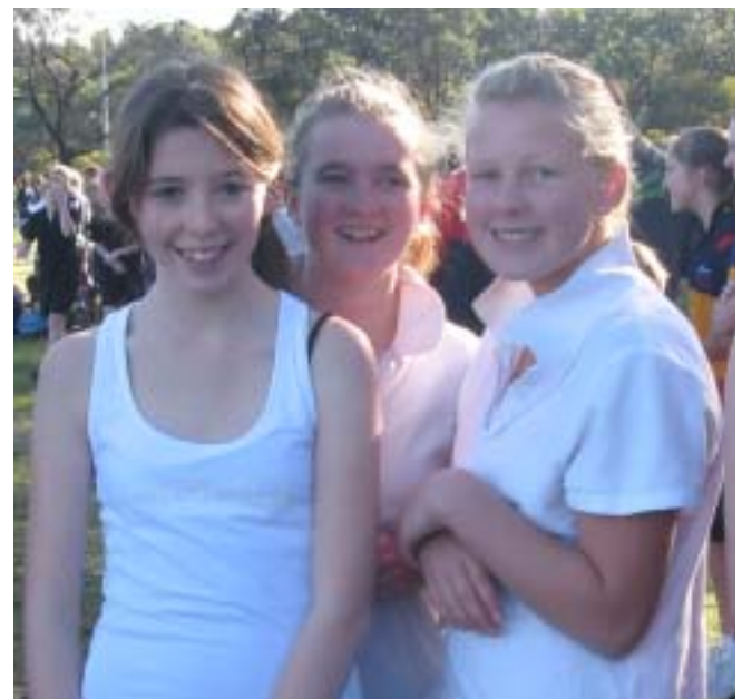
Above: Some of our competitors in the Western Zone Cross Country event.