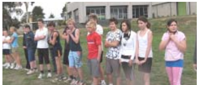
Above & below left: Students line up for the start of the House Cross Country event.