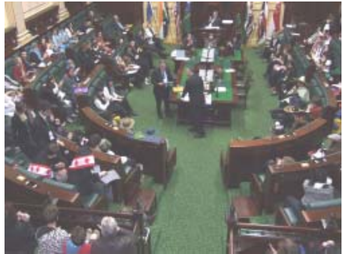
Above: The scene in the House of Representatives chamber at Parliament House, Melbourne during the recent Model United Nations Assembly (MUNA).