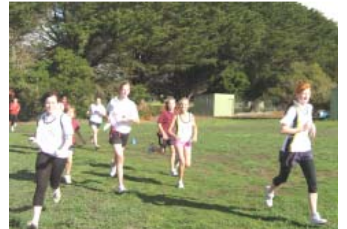
Above: Our girls and boys lead the way in the MWC Cross Country.