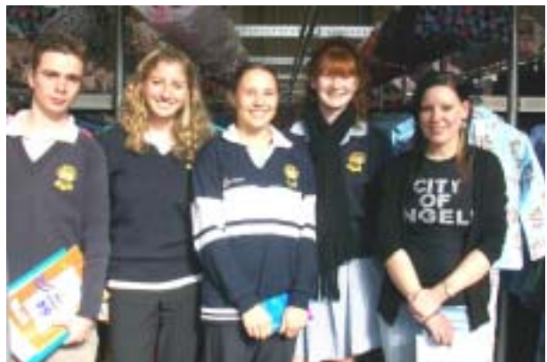
Right: The VC&D students during their tour of the Mitch Dowd company.