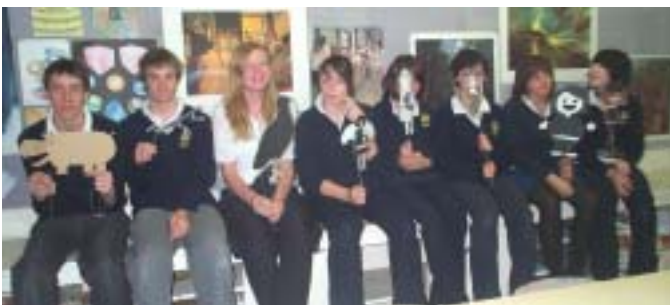
Below: The Drama students with their puppets.

FRIDGE POCKETS $4.00 each A handy magnetic A4 plastic pocket to hang on your fridge door for notices and reminders.