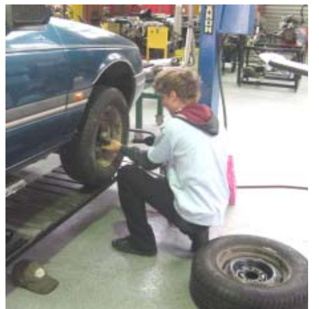
Photos: Hands on activities give students a greater insight into the various trade and career options available to them.