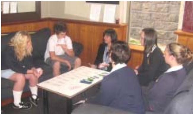
Above: Students learn useful strategies through games.

Students enjoyed the hands on, relevant and informative experience.