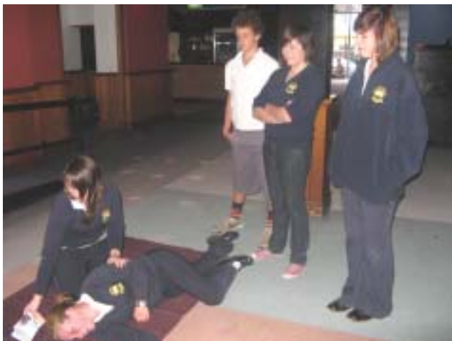
Below: Basic first aid training formed part of the program.