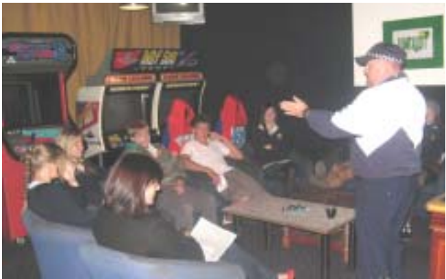
Above: Guest speakers give our students skills for life.